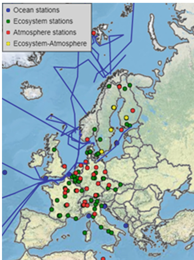
Fig. 3. Overview of the ICOS monitoring station network.

to a height of around 9 km into the atmosphere. Due to the potential damage to aircraft engines from the ash, the ongoing eruption of Eyjafjallajökull (see Fig. 4) from April to June 2010 led to the largest suspension of commercial air traffic since World War II. This closure of European airspace led to the cancellation of large numbers of flights that left millions of passengers stranded and cost airlines an estimated $200 million per day in lost revenue. The total global losses in GDP due to the prolonged inability to move people or goods have been estimated at approximately $4.7 billion. This figure incorporates both net airline industry and destination losses, along with general productivity losses [5]. The long-term effects of the eruption also continue to impact local inhabitants and the environment due to the potential toxicity to humans, animals and plant life either by direct inhaling the particulates or due to the acid rain that can result from the sulphur in the ash.