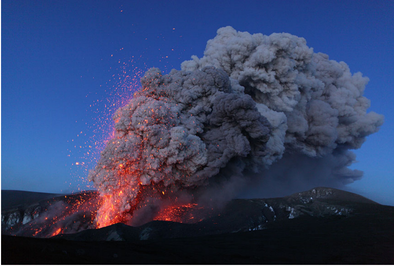
Fig. 4. The eruption of the Eyjafjallajökull volcano in May 2010 that disturbed air traffic in Europe for a sustained period, leading to large economic losses (photo credits: M. Rietze) ( http://www.tboeckel.de/EFSF/efsf_wv/island_10/Eyjafoell/may_10/may_10_e.htm ).

combination of a volcanic event with the prevailing weather conditions caused significant disruption both within Europe and beyond, with major economic and societal impacts. However, the potential for this type of event had been previously been recognised but precautionary measures to limit the impact of such an event had been limited [6].