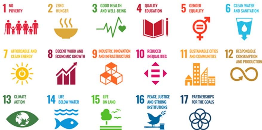
Fig. 1. The 17 sustainable development goals from the United Nations depicted as icons ( https://www.un.org/sustainabledevelopment/wp-content/uploads/2019/01/SDG_Guidelines_AUG_2019_Final.pdf ).

protection, and job opportunities while tackling climate change and environmental protection. The UN defined a set of 17 Sustainable Development Goals (SDG) where data is required in order to develop policies and evaluate and track the progress of the developments, as shown in Fig. 1. For the environmental research infrastructures (ENVRI) to be discussed in this book, most SDGs are very relevant but particularly relevant are Climate Action (Goal 13), Life Below (in) Water (Goal 14) and Life On Land (Biodiversity, Forests and land degradation) (Goal 15). Of course, all these SDGs are also closely related to SDGs like Energy (Goal 7), Sustainable production and consumption (Goal 12), Cities (Goal 11) and Water and sanitation (Goal 6). One of the global partnerships in the framework of the UN SDGs is the Global Partnership for Sustainable Development Data with motto: BETTER DATA. BETTER DECISIONS. BETTER LIVES 6 .